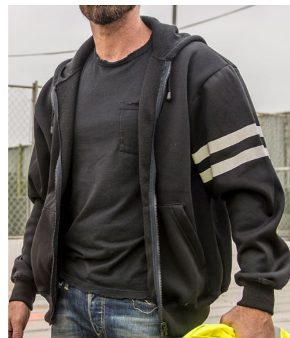
Standalone zip up hoodie.